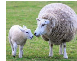
Sheep and lamb