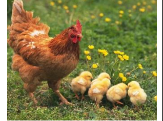
Chicken and chicks