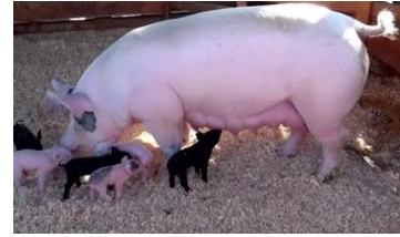
Pig and piglets