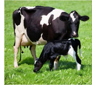
Cow and calf