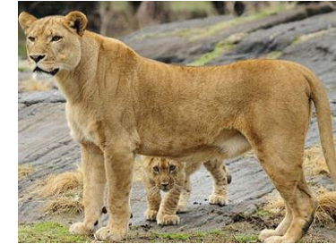
Lioness and cub